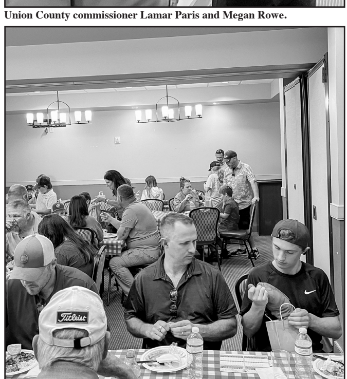
The Mountain Masters Jr Golf league hosted its banquet at the Union