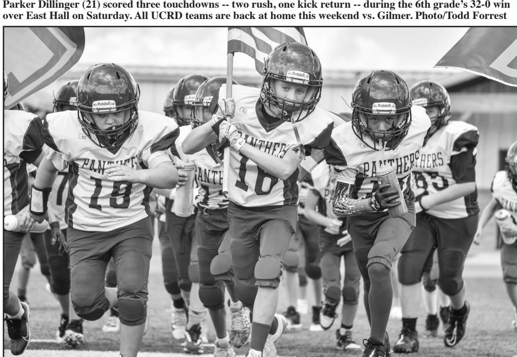
Union County's 4th grade team is 3-2 on the year and sitting in third place in the Mountain Athletic Confer-