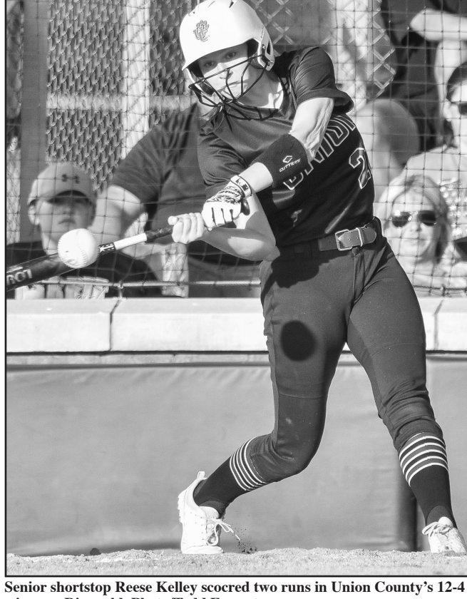
win over Ringgold.

Union County stranded two runners in the second and